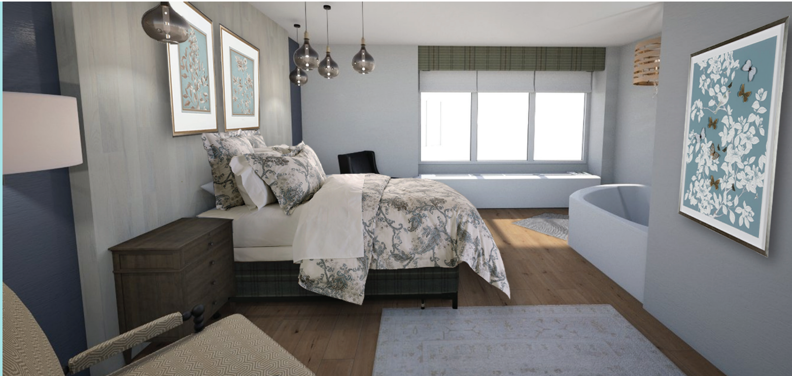
The Mary V. O'Shea Birth Center, pictured here, is the next step in the evolution of comprehensive women's health services provided at Saint Peter's.

A regional leader in maternal health services, delivering thousands of babies every year, Saint Peter's University Hospital was New Jersey's first state-designated Regional Perinatal Center to provide exceptional high-risk maternity care for women and their newborns. With services that range from a midwifery service to an award-winning Level III Neonatal Intensive Care Unit (NICU), Saint Peter's has set the standard for maternal and newborn care.