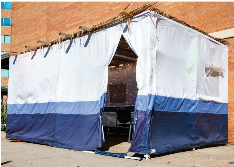
The sukkah outside Saint Peter's University Hospital.

Rabbis from Saint Peter's Pastoral Care Department help facilitate the practice of religious rituals. In addition, the hospital arranges for shofar blowing by Jewish chaplains on Rosh Hashanah. On Sukkot, Saint Peter's constructs a sukkah outside the hospital. The hospital also arranges for mishloach manot, donated by the Raritan Valley Bikur Cholim, to be delivered to Jewish patients on Purim.