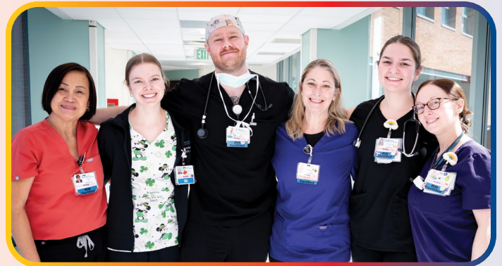
Saint Peter's PICU (top) and ICU (bottom) nurses were recognized for providing exceptional patient care.