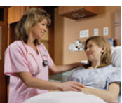
Saint Peter's University Hospital

■ State-designated children's hospital and regional perinatal center ■ Affiliate of The Children's Hospital of Philadelphia