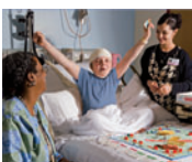
Children's Hospital at Saint Peter's