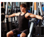
Saint Peter's Sports Medicine Institute