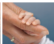
Saint Peter's Foundation