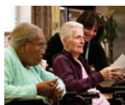
Margaret McLaughlin McCarrick Care Center