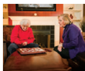
Saint Peter's Adult Day Center